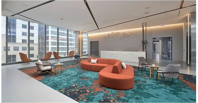
110 Conference Center - 110 N Wacker - Chicago, IL 60606