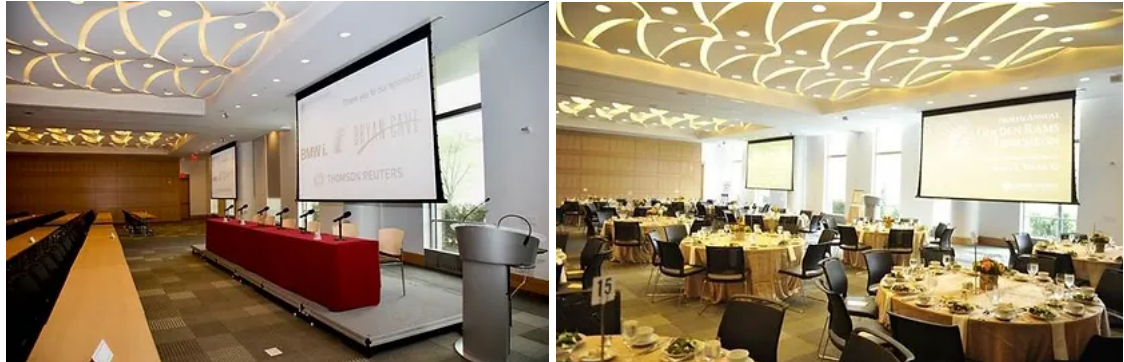
Fordham University, | 150 W 62nd St, New York, NY 10023