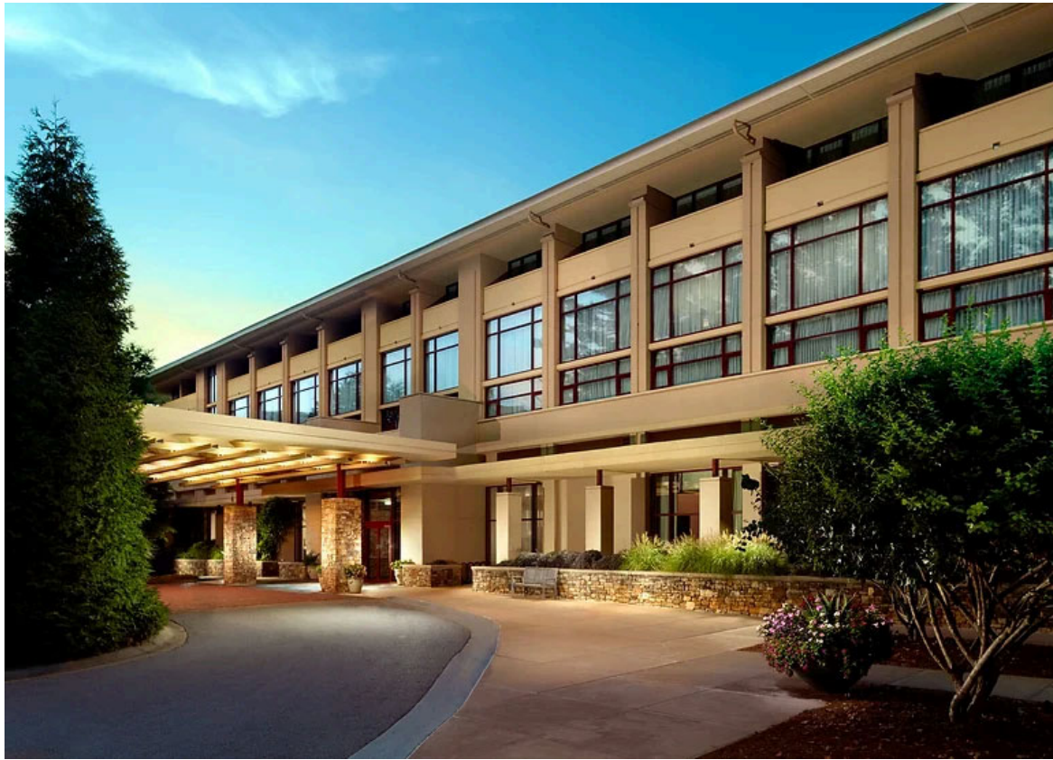
Emory Conference Center Hotel | Lullwater Ballroom | 1615 Clifton Road NE, Atlanta, GA 30329