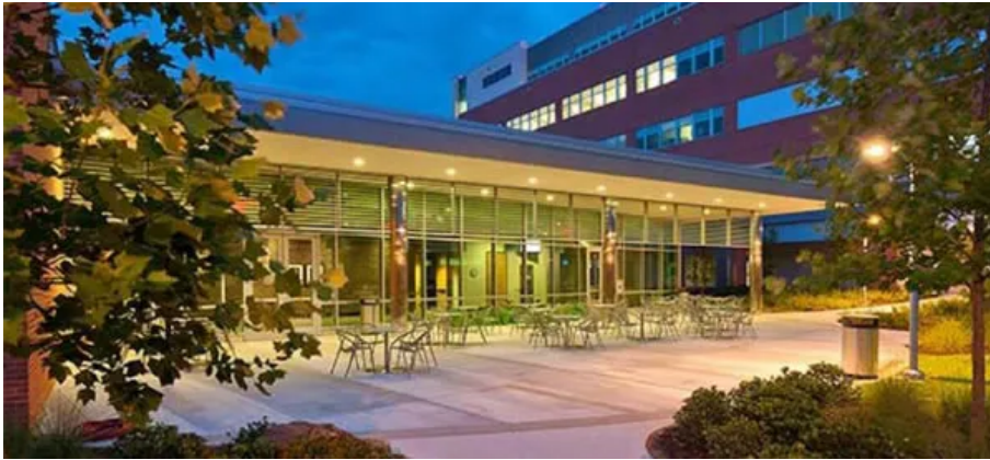
UT Health/Cooley Center

The Denton A. Cooley, MD and Ralph C. Cooley, DDS, University Life Center UTHealth Houston - 7440 Cambridge Street - Houston, Texas 77054